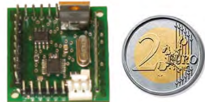
Figure 2: ATmega128 Node

The Smart Car's operation can be categorized into four main fields as shown in Figure 3 – software, electrical hardware, electro-mechanical hardware and mechanical hardware. The software layer consists of the application software and the TTP/A-protocol software. The application software exchanges data with the protocol software running on the same node and performs the tasks which are required for communicating in the distributed fieldbus network according to the rules specified in the protocol definition. The electrical hardware layer consists of a fieldbus network, complete with TTP/A nodes and the car's TTP/A communication bus. The smart car consists of 12 ATmega 128 nodes like the one shown in Figure 2. The five sensor nodes (three infrared-nodes and